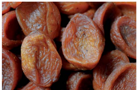
Dried apricots at the local market in Osh

Inspectors from Hungary, the Netherlands and Sweden gave hands-on training courses on how to apply standards for apples, apricots, dried apricots and grapes, pistachios and walnuts. They also discussed the current general and food-safety requirements for exporting agricultural products to the EU,