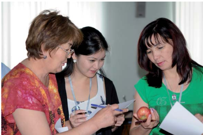
Participants assess the quality of apples

The Russian Federation and Tajikistan have requested follow-up workshops in September 2010 to discuss difficulties that CIS countries are likely to face in implementing UNECE's international standards. These countries need assistance in developing their legal and technical infrastructure to be able to enforce the practical application of standards.