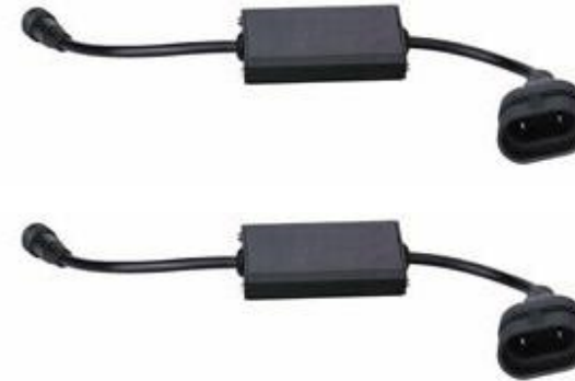
Additional Electronics device Marking: