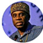
H.E. Mr. CHIBUIKE ROTIMI AMAECHI

Executive Director National Road Safety Council Lebanon