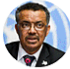
TEDROS ADHANOM GHEBREYESUS