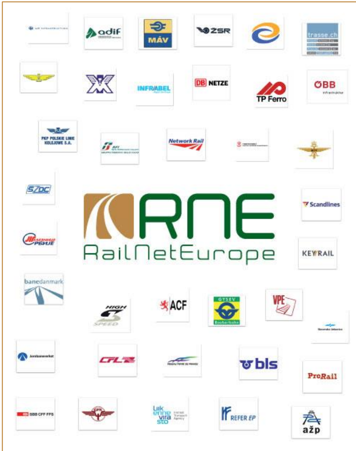
RNE Members Network