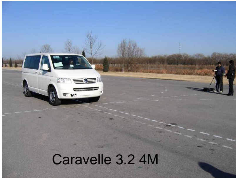
Caravelle 3.2 4M

Light bus, between M1 and M2 category. (market in China \approx 300,000 vehicles sold per year )