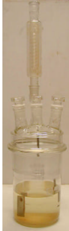
Fig. 2: Exposure receptacle with reflux condenser

At least 3 sets (9 specimens) of each material shall be used. 3 l cup-like reaction receptacles with face cut top and three necks NS 29/32 as well as one neck NS 14 made of glass or PTFE shall be used. The entrance of air, however, into the receptacle has to be guaranteed. Aluminium- and steel-samples have to be tested in different reaction receptacles. To prevent liquid loss a reflux condenser should be attached (Fig. 2).