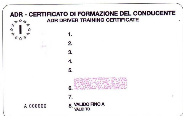
Mod. MC 723F - Recto

The certificate is printed on a plastic card using black ink. It contains an invisible background (blue-red-blue fluorescent-iridescent ink).