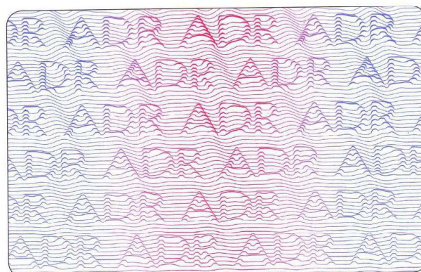
Mod. MC 723F - Verso Fondo Invisibile Fluorescente Iride blu-rosso-blu