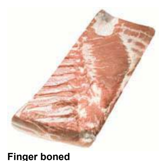
i iligei bolice