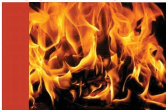
Wood confirmed as the primary source of renewable energy in Europe