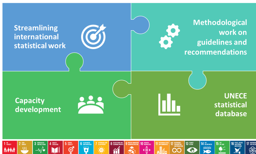
Figure 1. Interconnected work streams of the UNECE Statistical Division

6. The UNECE Statistical Division supports streamlining international statistical work in the region through providing the secretariat for the Conference of European Statisticians – the highest level intergovernmental statistical body in the UNECE region and a platform for regional coordination of international statistical work.