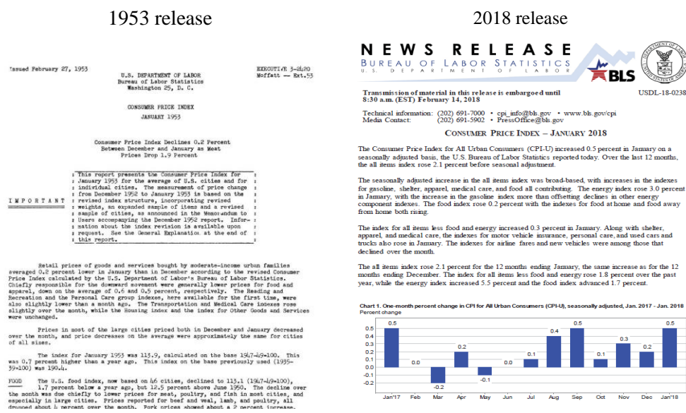
Figure 1 Comparative of monthly releases of the US Consumer Price Index (CPI)

6. There are efforts underway at BLS to redesign news releases. Known as “next generation” news releases, they are designed as a web product, complete with mouse-over definitions, direct links to data series, and “tweet-able” statements. In addition, the agency is experimenting with machine-learning techniques that would have the computer identify and write the key highlights from the data. In the spirit of remaining impartial and consistent, computers may do a better job of avoiding bias in the text than do human beings.