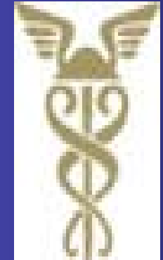
The Russian Federation Chamber of Commerce And Industry

The Russian Federation Ministry of Industry, Science and Technology