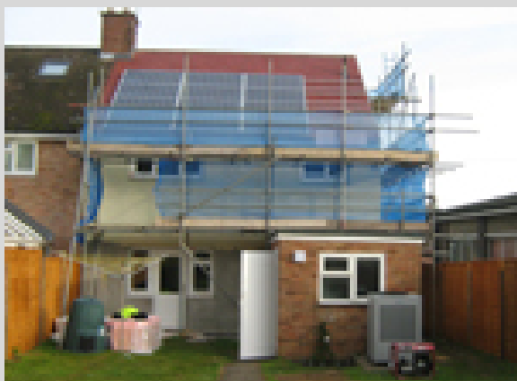
Domestic refurbishment – Halstead, Essex, UK

Against this background, members of the Royal Institution of Chartered Surveyors' Professional Group on Sustainability recently carried out a statistical pan-European survey between four different certificate issuing organizations: BRE Environmental Assessment Methodology - BREEAM (UK), Leadership in Energy & Environmental Design – LEED (USA), German Sustainable Building Council, and High Quality Environmental Standard (France).