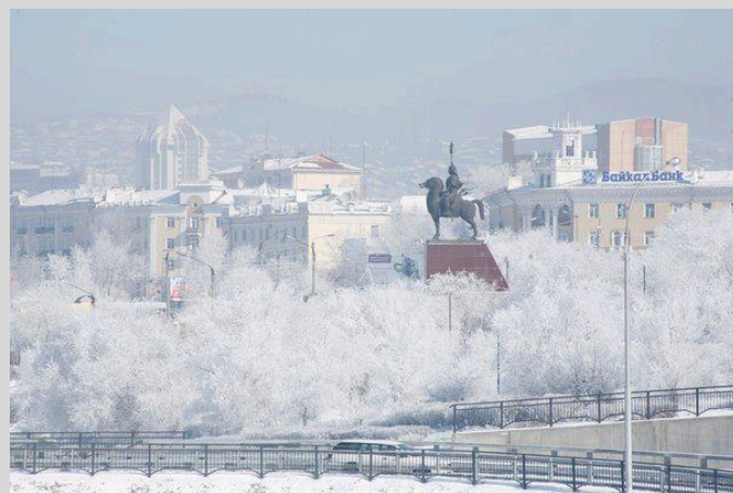
Photo: Ulan Ulde in winter

This city is located near Lake Baikal and 200 km from the Mongolian border. It lies 5,640 kilometres east of Moscow and according to preliminary results of the 2010 census, 404,357 people live in Ulan-Ude, making the city the third largest in eastern Siberia in terms of population.