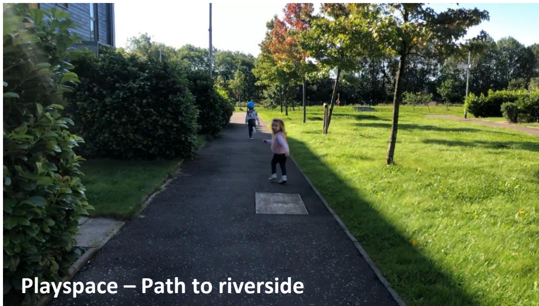
Playspace – Path to riverside