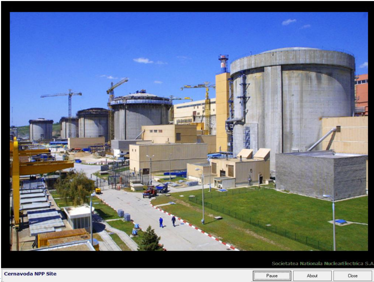
Cernavoda NPP Site