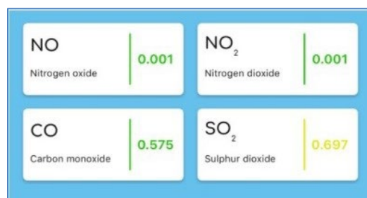
Figure 20.2. Public awareness-raising on air quality through the AirKz smartphone application

The EPR of the former Yugoslav Republic of Macedonia assessed progress since 2011 on air quality, water management, biodiversity, forestry and protected areas, waste and chemical management, climate change and greening the economy. The review also assessed the country's progress towards relevant targets and indicators of the SDGs, examined how the SDGs are being adapted to the national context and put into practice, whether the necessary resources have been allocated and responsibilities are clear, what obstacles have been encountered when targeting the Goals and what concrete results have already been achieved.