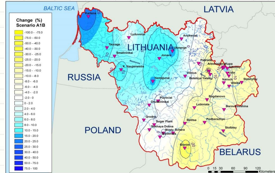
Example of the multi-model map with summer runoff forecast until 2050

*(coordinated) basin-level actions are needed