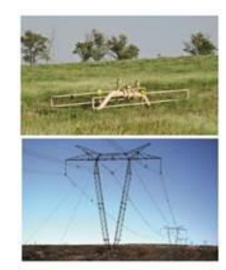
Enhanced CH<sub>4</sub> Recovery and CO<sub>2</sub> Sequestration