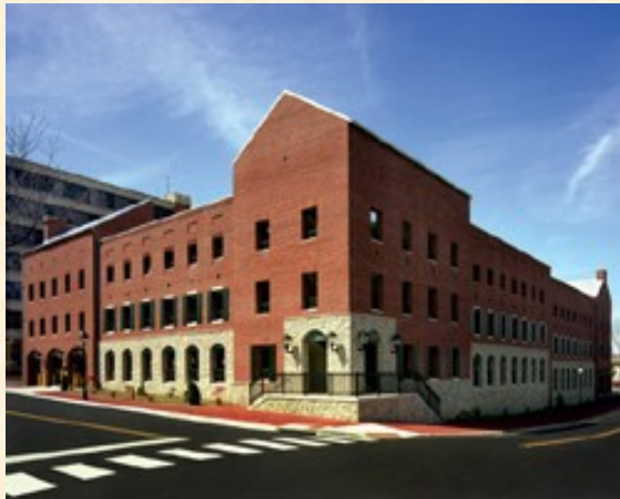
Fredericksburg, VA Parking Lot