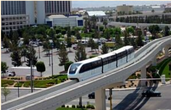
Las Vegas Monorail, Nevada