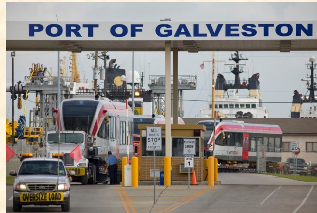
Port of Galveston, Texas