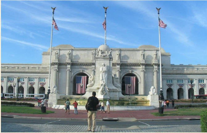
Union Station, Washington, DC