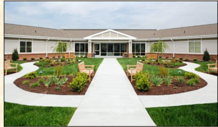
Hancock Geriatric Treatment Center, Williamsburg, VA