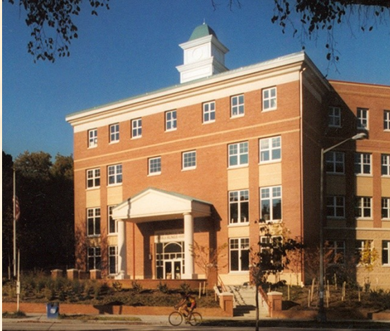
James F. Oyster School, Washington, DC