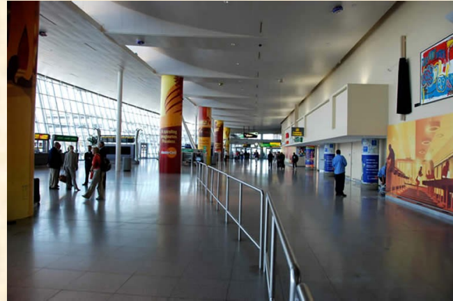
JFK International Terminal 4, New York