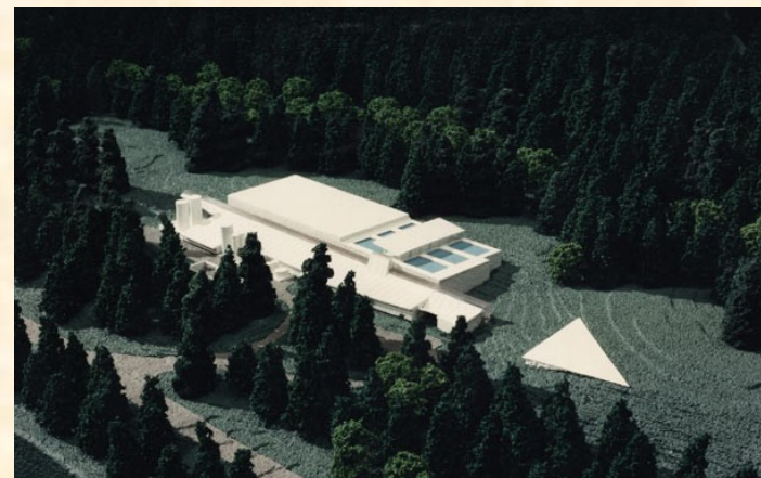
Tolt Water Plant, Seattle, WA