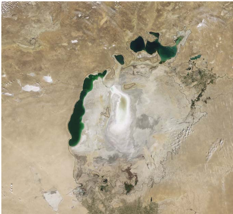
The Aral Depression and Remaining Water Pockets (August 2009)

The purpose of this paper is to briefly describe the present situation in the Amu Darya Basin focusing on the Afghan part of the basin and its future irrigation development, and attempting to use commonly accepted – and objectively verifiable – information and data, the availability of the latter being one of the major constraints in finding common ground and solutions to the prevailing – and aggravating – water shortage problems in the Amu Darya Basin. Overall goal is and will be the joint management of shared water resources for the benefit of an increasing (urban) population in the five riparian states (Kyrgyzstan, Tajikistan, Afghanistan, Uzbekistan and Turkmenistan). All these five countries face similar challenges in water management: they need to boost their human and institutional capacity for integrated water resources management (IWRM), improve their drainage networks on irrigated soils, and facilitate the expansion of water-saving irrigation technologies.