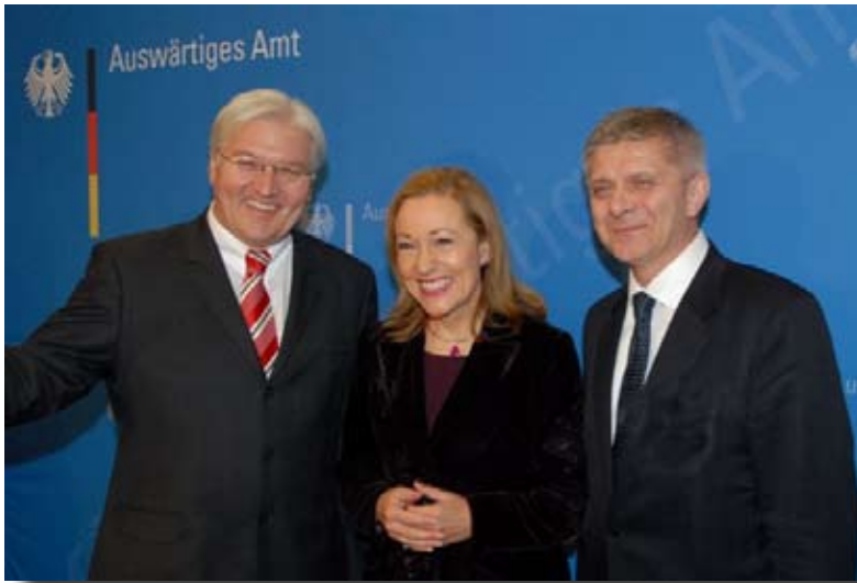
Federal Foreign Minister of Germany and Vice Chancellor Dr. Frank-Walter Steinmeier, European Commissioner Benita Ferrero-Waldner and Executive Secretary Marek Belka at the SPECA Berlin Forum.

The Second Meeting of the 2007 United Nations Special Programme for the Economies of Central Asia (SPECA) Economic Forum was co-organized by the UNECE and the Government of Germany on 13 November in Berlin in the form of the Conference “Central Asia and Europe: a New Economic Partnership for the 21st Century”. The First Meeting of the Forum “Focus on Asia” was held last May in Almaty.