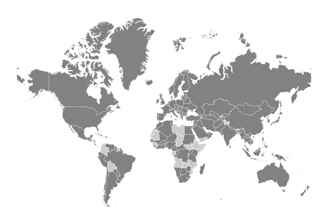
Legend: Dark grey: contracting parties - Light grey: non-contracting parties