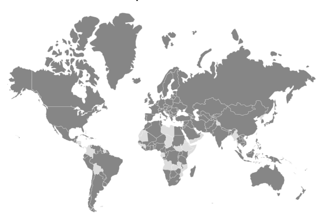
Figure III ECE and non-ECE Contracting Parties to at least one United Nations Transport Convention

Legend: Dark grey: contracting parties - Light grey: non-contracting parties