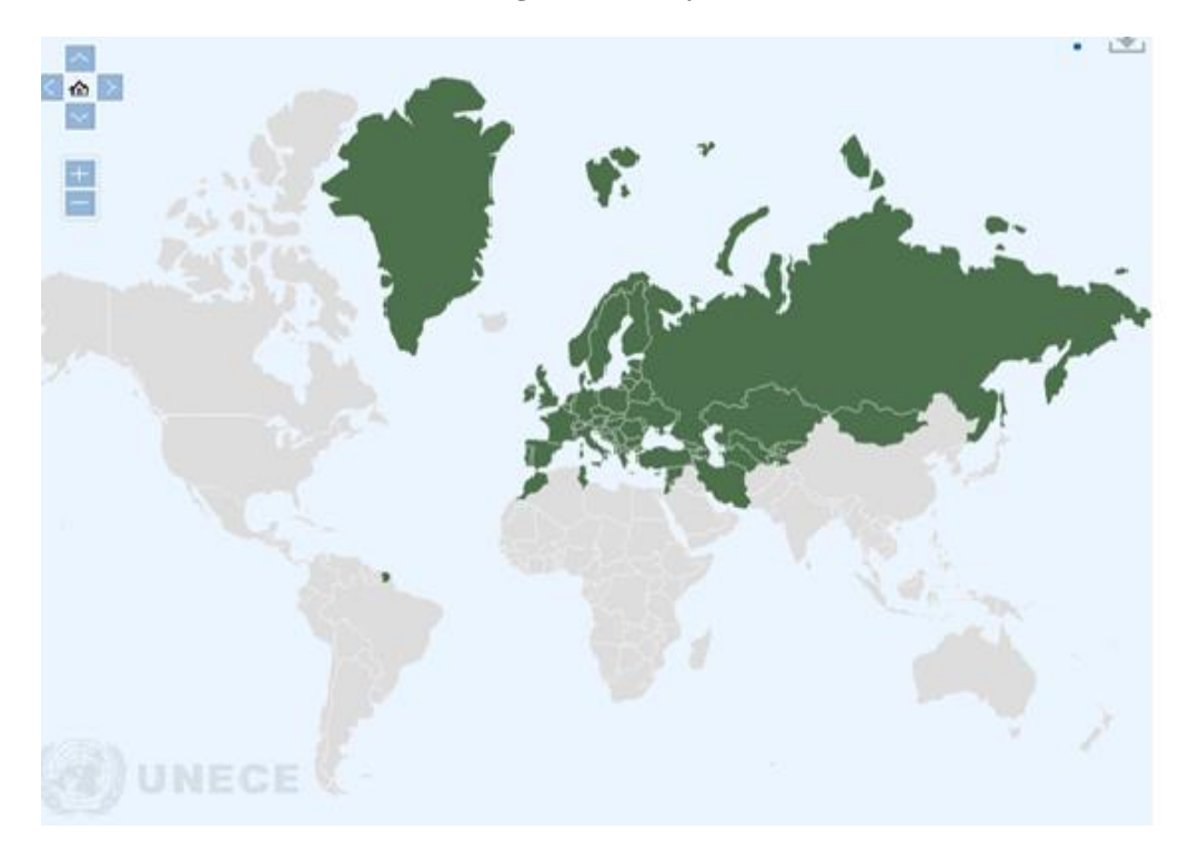
Figure 1 Geographical overview of the 55 contracting parties to the Convention on the Contract for the International Carriage of Goods by Road (CMR)

the eCMR platform even though it is hosting private contracts. This is because in some countries, drivers are often asked by the competent national authorities to show paper CMR consignment notes for risk management purposes.