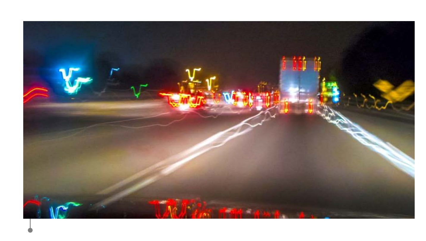
Beirut, 12-13 September 2017