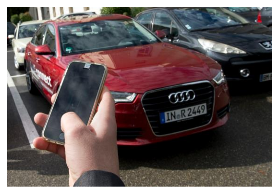
Demonstration in the Palais des Nations on 16 September 2015

6. The expert from OICA introduced GRRF-80-18 (i) presenting the system and those Regulations relevant for the type-approval of this system, (ii) concluding that RCP could by type-approved according to Regulations Nos. 79 and 13-H and (iii) in line with the requirements of the 1968 Vienna Convention on road traffic. The expert of GRRF expressed first positive comments about the systems and agreed that clarifications should be added in the relevant Regulations to capture the benefits of such systems without compromising safety. GRRF noted that even though correctly type-approved, such system would still be subject to regulations related to the use of road vehicles.