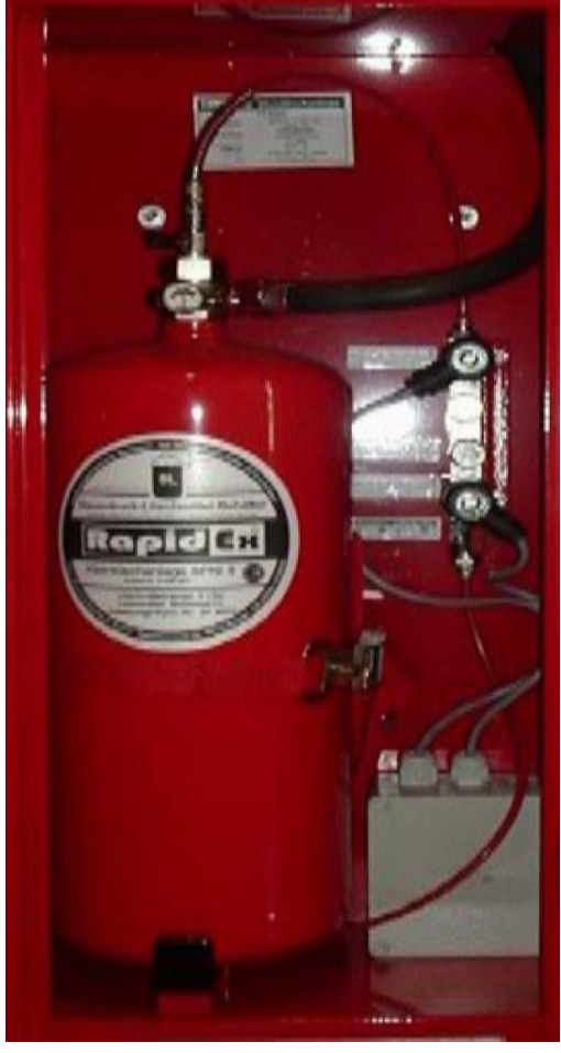
Suggestion for a definition of fire extinguishers assigned to UN No. 1044

This addresses components which are not complete and cannot immediately be used as fire extinguishers, e.g. extinguishing agent containers with piping, pre-installed in a cabinet.