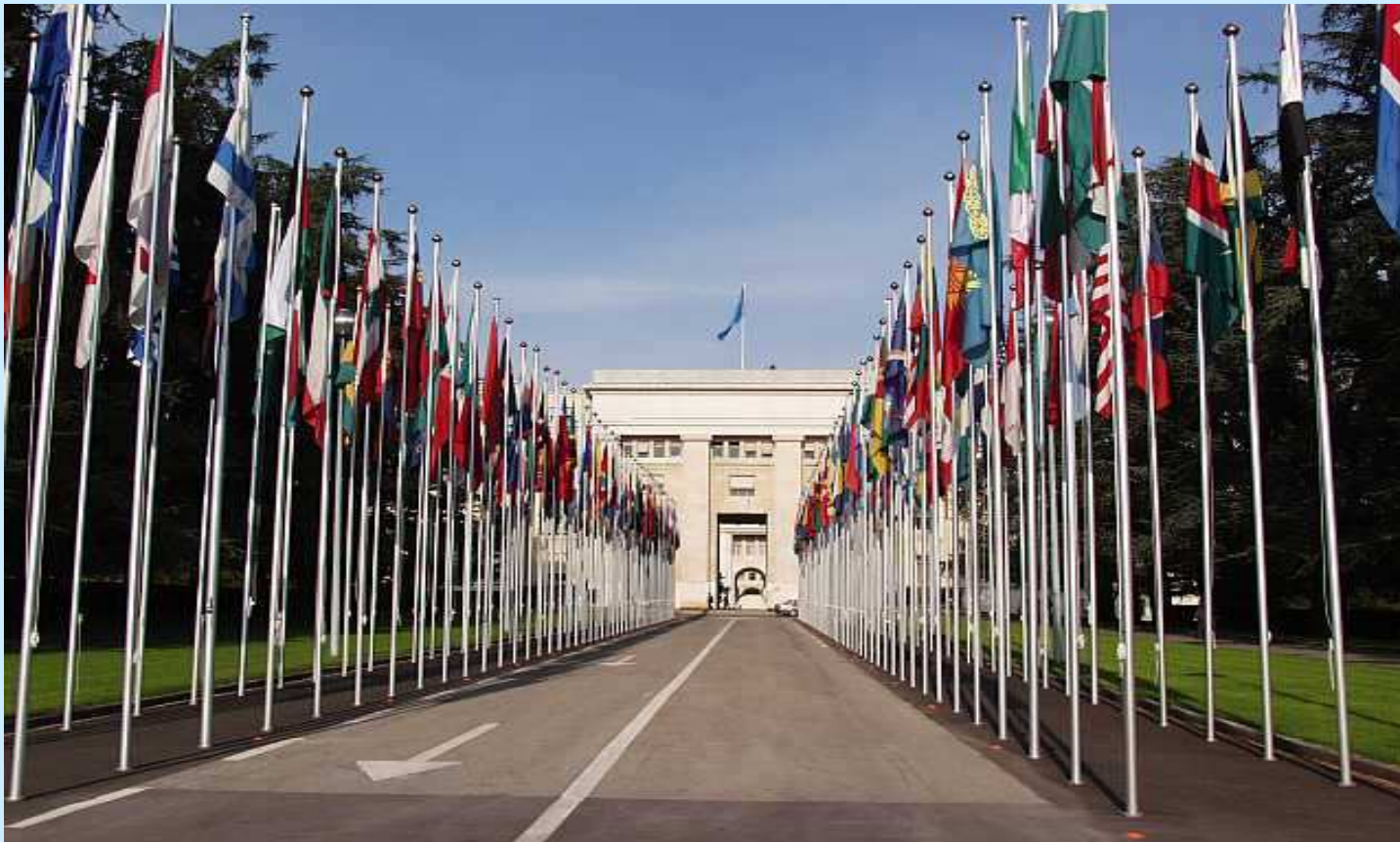
Palais des Nations, Geneva (Switzerland)