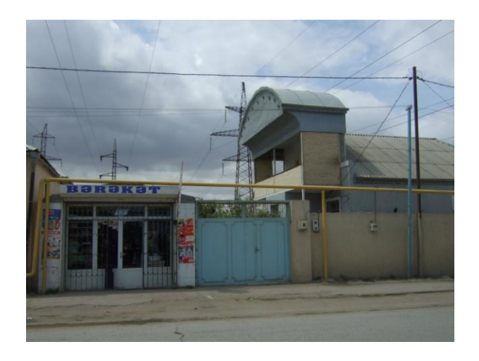
Picture 13. Informal settlement in Azerbaijan, May 2009

Many cases of "illegality" fall into the categories of squatting and the absence of legal documentation. The Government has developed some changes and amendments to current legislation allowing the population to legalize these buildings. Also, the Government has taken a liberal policy towards IDPs who have already constructed their buildings and are now living in illegal settlements.