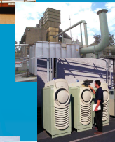
Mine Ventilation Air