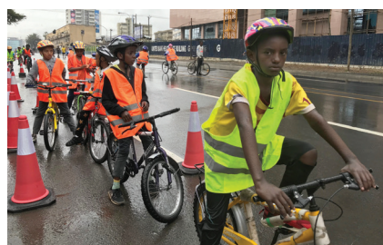
Our work on the ground