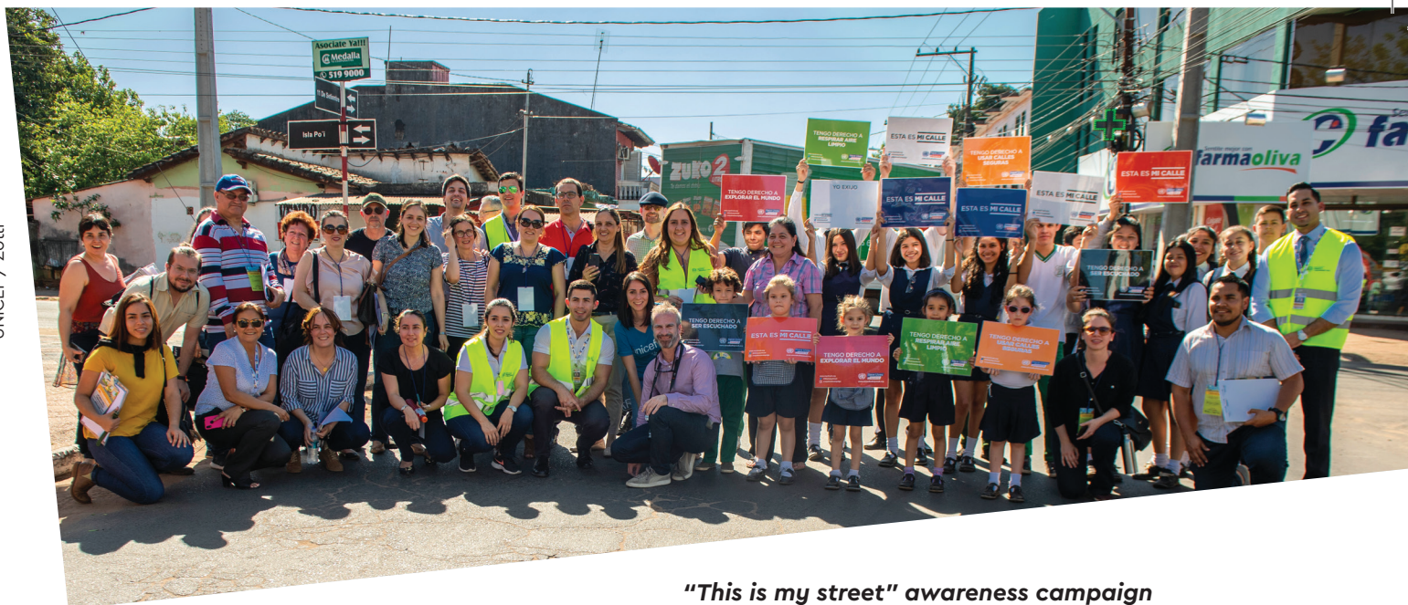
"This is my street" awareness campaign with children on safe journeys to school on 24 October in Fernando de la Mora