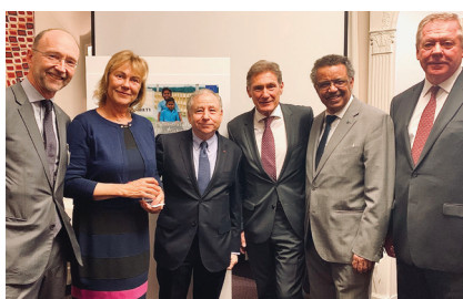
2019 Call for Proposals