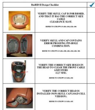
Appendix E – BioRID II Design Checklist