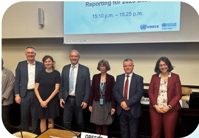
North Macedonia (October 2023)