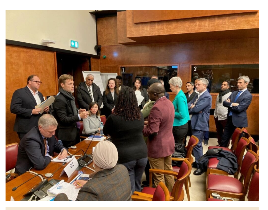
Market place at the Global workshop